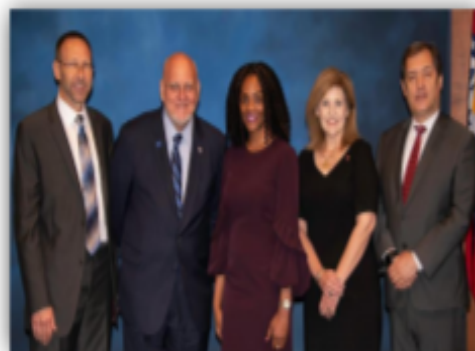
Little Rock, AR